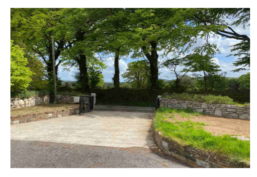
For clarification we wish to inform prospective purchasers that we have prepared these sales particulars as a general guide. Some photographs may have been taken using a wide angle lens. We have not carried out a detailed survey, nor tested the services, appliances and specific fittings. Room sizes should not be relied upon for carpets and furnishings, if there are important matters which are likely to affect your decision to buy, please contact us before viewing the property. Please refer to our website for information on referral fees - www.webbers.co.uk